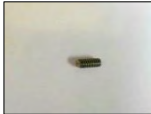
Set Screw, 10-32 x 3/8"