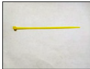
6" Zip Tie